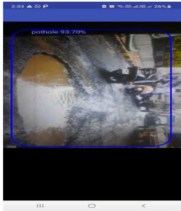
Figure 6: Camera Based Pothole Detection On A Route In Indore With Confidence Interval

User enters the source and destination location according to which a route will be marked on the map. After clicking on the Camera based pothole detection button, the application runs camera and detects pothole. Rectangular box with confidence interval will appear whenever a pothole will be detected.