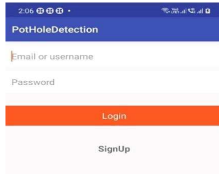
Figure 3: Sign Up Page

TensorFlow version, we can now test the model on a route in Indore. The user has to first register in the Pothole Detection Application and provide input of source and destination location based on which a route will be marked on the map and a notification will be sent to the user whenever a pothole is detected. The user interface and camera-based pothole detection are shown below –