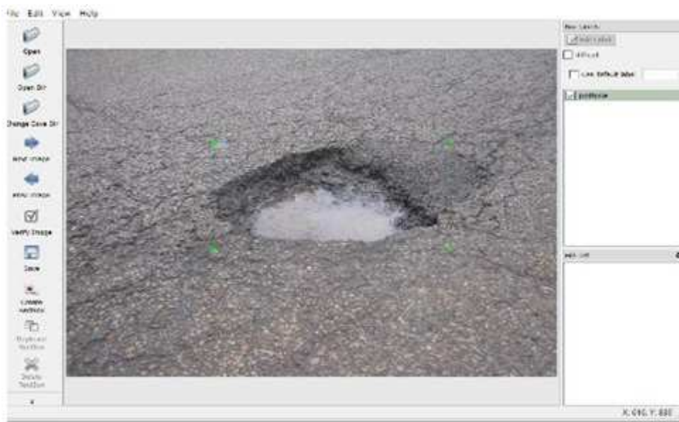
Figure 1: Label Img Tool for Labelling Potholes