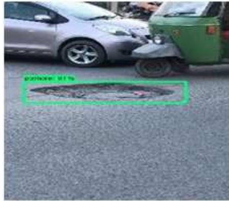
Figure 2: Pothole detection through SSD