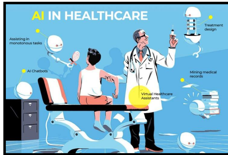
Figure 3: Represents the AI based IoT Devices and Diagnostic Tools

to make Sugar IQ, a diabetes administration framework has been established [22]. Besides, machine learning has been utilized in cases of in-vitro discovery of maladies like tuberculosis and dementia. Meanwhile, ponders have revealed that detailed enhancement in demonstrative affectability and specificity by applying machine learning to multi-biomarker investigation have been utilized in real-world cases to classify cancer-related biomarkers [23, 24, 25 and 26].