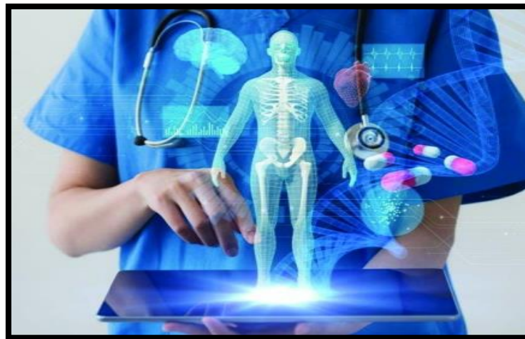
Figure 2: Represents the AI based Medical imaging of Human body

Philips Healthcare is endeavoring to showcase its Intelli Site Pathology Arrangement within the domain of advanced pathology diagnostics and has made Intelli Space Revelation, an open stage for AI investigation and execution [17]. For the creation of the Therapeutic Imaging Cloud AI stage, Arterys' Cardio AI, Liver AI, and Lung AI program have obtained FDA authorization [18]. In expansion to the occasions portrayed over, a number of businesses—including Zebra Restorative Vision and AI doc—are looking for to advertise AI-based therapeutic picture examination and innovations. By getting authorization from the Service of Nourishment and Sedate Security, a number of companies in Korea, including Vuno, Lunit, JLK Assessment, and Deepnoid, have started commercialising AI-based restorative picture examination (Fig. 2).