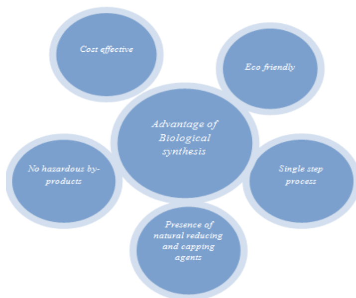
Figure 2: Advantages of the biological method of Nanoparticle synthesis