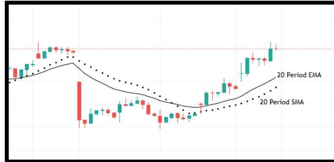
Figure 2: SMA and EMA

SF is Smoothing Factor. The most common value is 2, N is the total number of periods.