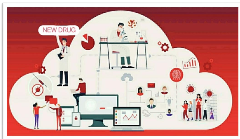
Figure 1: Digitalization Fastening the Process of Drug Discovery