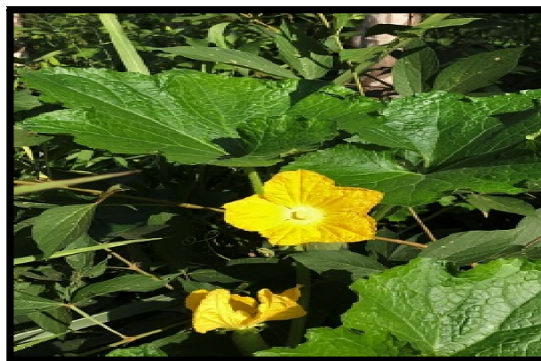
Figure 2: Benincasa hispida