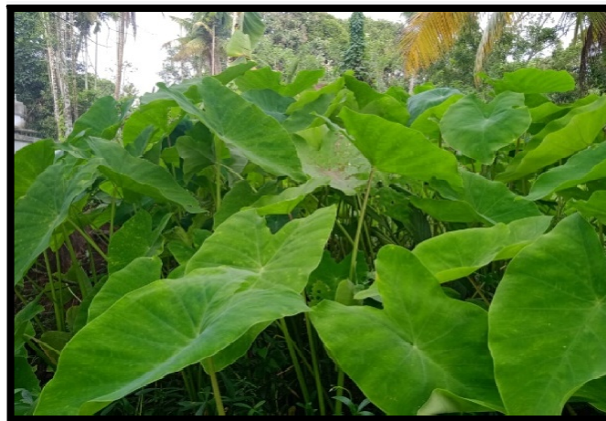
Figure 1: colocasia esculenta

Colocasia esculenta is a herbaceous erect perennial tuberous plant belonging to the family Araceae. It is a fast growing plant seen along streams canals and other aquatic locations with large edible corms. The large leaves are arrowheaded in shape and are peltate grows up to 2 feet long. The taro leaves are well known for their hydrophobicity[1]