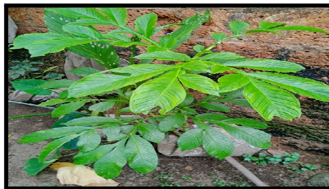
Figure 4: Amorphophallus paeoniifolius