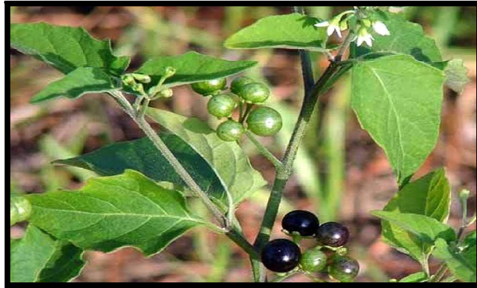
Figure 9: Solanum nigrum

Solanum nigrum Linn. is a herbaceous weed commonly seen in waste places and roadsides throughout India. Kaangannee, Kaamonnee, Makoi are the common Indian names and Black night side in English. Solanum subrum Mill ex Wight and Solanum incertum Dunal ex Graham are two synonym varieties of the plant [58].