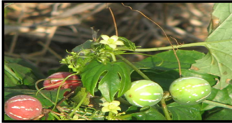
Figure 7: Diplocyclos palmatus

Morphological variations and medicinal uses of Diplocyclos palmatus (L.) were studied. Both stem and leaf exhibit analgesic and anti-microbial properties, root exhibits anti-asthmatic and antidote effects, leaf also possesses anti-inflammatory and antidote effects. The fruits and leaves are effective in relieving stomach pain, stems, fruits and seeds used as expectorant, laxative and febrifuge respectively. The aerial plant parts are also used as Aphrodisiac and tonic, in treatment of diarrhoea and malaria.[48].