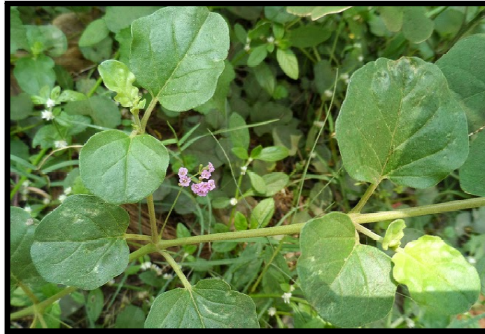
Figure 8: Boerhaavia diffusa

Boerhaavia diffusa Linn. is a diffusely branched, glabrous prostrate herb belonging to the family Nyctaginaceae. Boerhaavia repens Linn. and Boerhaavia procumbens Roxb. are its two synonym varieties, which is called as Shweta punarenavaa used for Punarnava drugs and Raktapunarnava for Varhabhu drugs in ayurveda respectively. The plant is commonly known as Hogweed, Patagon in English and Punarnawaa, Raktavasuu, Biskhafra are Indian names[53]. Boerhaavia diffusa is a creeping herbaceous plant with cylindrical, creeping stem sometimes purplish or greenish in colour, swollen at the nodes [54].