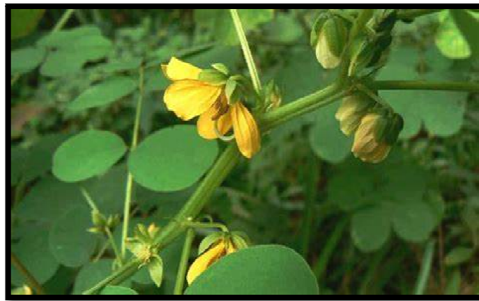
Figure 7: Senna tora (Thakara)

Senna tora belonging to the family of Fabaceae is an herbaceous plant with alternative pinnate leaves and can grow 12–35 inches tall [43].