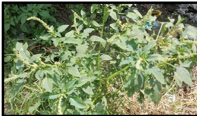
Figure 5: Amaranthus spinosus

Amaranthus spinosus , a perennial herb with erect branched spinosus belonging to the family Amaranthaceae, which is common and abundant in cultivated land and waste land as weed. Also known as prickly amaranthus in English and as Kate matha, Tandullajaa in India[31].