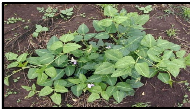
Figure 3: vigna unguiculata

Vigna unguiculata is a leguminous plant which has medicinal properties belongs to the family Papilionaceae. Review regarding medicinal, phychemical and